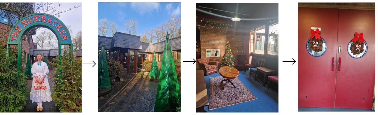
You will then come to a fork in the path, if you turn tight you will find The Nutcracker Archway.